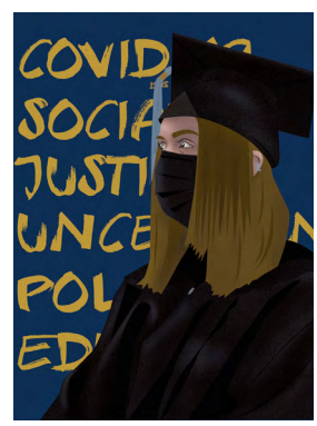
Classes of 2020 & 2021

"The cap and gown does not signify our graduation; our determination, motivation and hard work is what embodies our graduation and exemplifies our accomplishments."